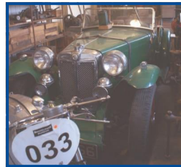
MG PA Sports Two-Seater