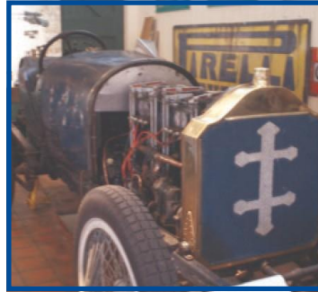
Lorraine Dietrich Vieux Charles III

HINT These cars can be found in the Campbell Shed (no. 2 in the Trail Guide)