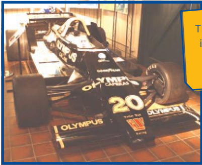
Olympus Wolf WR7

HINT This car can be found in the Jackson Shed (no. 5 in the Trail Guide)