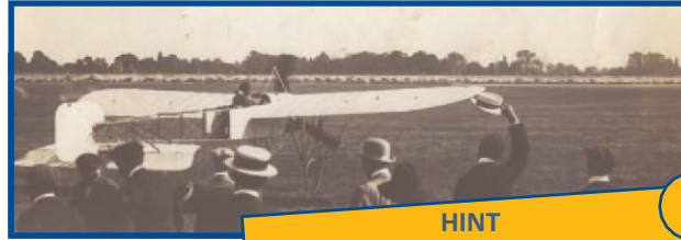
The Daily Mail Air Race in 1911